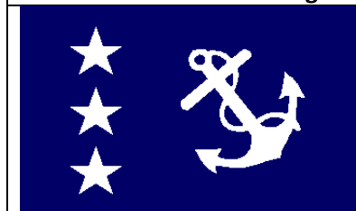
Past Commodore Flag