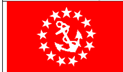
Vice Commodore Flag